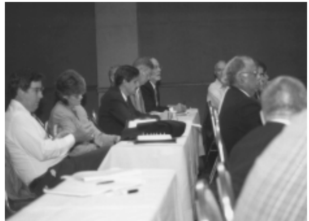
AAVLD Members attend a scientific session at the 41st Annual Meeting in Minneapolis, MN October 2 - 9, 1998